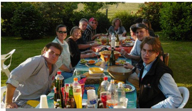
Enjoying the great outdoors at the MLLP Volunteer Feast